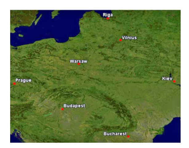
Fig. 1. Airports included in the route study on the Great-circle mapper

These results exclude intercontinental flights and domestic flights. The results of the analysis can be seen in Table 2 highlighting the percentage of all flights taking place to a certain direction. The data has been collected