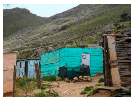
Fig. 3. Langrung informal settlement in Stellenbosch (South Africa) is located on a steep hillside

Across developing countries, informal settlements are generally established through processes that take advantage of unutilized land (Alsayyad 1993; Van Gelder 2010). Such land, often of ecological significance and biodiversity wealth, is unsuitable for residential development because of its location near streams, on low-lying river banks, within wetlands, on steep hillsides or servitudes, buffer strips and other kinds of interstitial space. Through an analysis of urbanisation in developing countries, Seto et al. (2012) and Guneralp