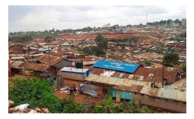
Fig. 2. Kibera settlement is located on a low-lying part of the Nairobi river bank

main ways. Location in ecologically-significant, environmentally-sensitive and biodiversity-rich places within cities is one. Agricultural cultivation within low-income urban areas is another, while an ecological approach to infrastructure is the third form of connection.