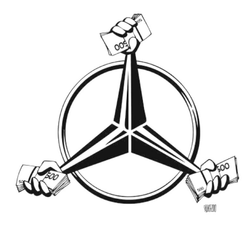
Fig. 6. Author: Gatis Šļūka

Still there is also an opposite example that could be represented in interesting opinions; see the caricature below.