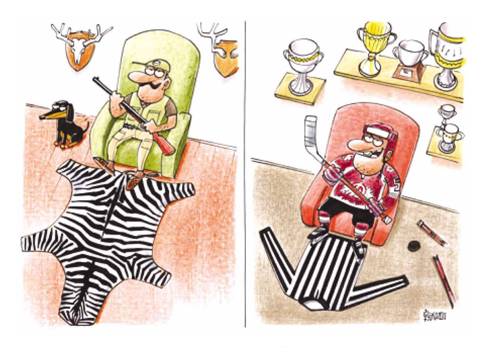
Fig. 3. Author: Gatis Šļūka

It is more likely that people would accept such invitation gladly! However they also set the rules. The viewers want this "caricature literature" would not be direct, clearly realizable at first sight. When directing information towards a large number of people, the best information forms will be those allowing broad variety of interpretations, i.e. information that allows personal interpretations of different types. In this respect, the picture as a code form for the message becomes very interesting (Ginman, Ungern-Sternberg 2003: 76). The reason being the following: it is a challenge to understand the joke, but the solution of it is the source of satisfaction. That is the reason why humour loses its power and attraction when it is too obvious. For example, it was discovered that children are choosing more and more difficult jokes by the time they are developing (Sills 1972: 3), so it means – by the time they are improving their knowledge.