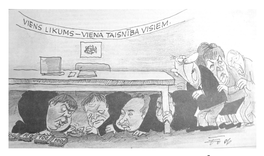
Fig. 1. Written on sign: "One law, one justice to all". Author: Ēriks Ošs

Consequently a question – how caricature can still keep its meaningful position in the field of humour – rises. It could be partly explained by Childers' and Houston's thought that people remember pictures better than, for example, verbal messages. This fact could also be supplemented by the power of picture itself. One thing is to say that someone is doing illegal or wrong things, to laugh about someone's looks. But completely other thing is to accomplish it into one picture that shows all those told "defects" with exaggeration, but really clearly. It is like a process where a word obtains its visual expression that shows all the ugliness per se .