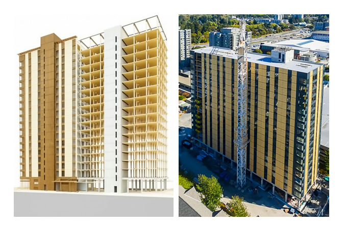
Figure 4. Brock Commons Tallwood House, Vancouver, Canada (Wood Skyscrapers, 2016; Archinect, 2016)