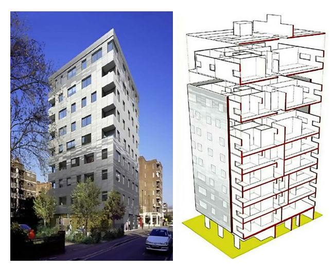
Figure 7. Murray Grove Stadthaus , London, UK (Cvetkovic, Stojić, Krasic, & Marković, 2015)

Murray Grove was named the world's first housing high-rise building constructed entirely from prefabricated CLT panels, with its core, load-bearing walls, floor slabs,