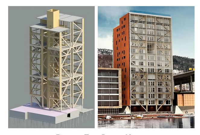
Figure 5. Treet , Bergen, Norway (Malo, Abrahamsen, & Bjertnæs, 2016)