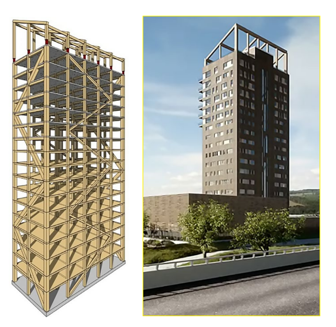
Figure 3. Mjøsa Tower , Brumunddal, Norway (Voll Arkitekter, 2019)

The load-bearing structure is made of Kerto laminated veneer lumber (LVL), with glulam columns and beams. Prefabricated wooden elements make up the first ten floors while the upper floor decks are constructed of concrete, which adds more weight to stabilise the building. Prefabricated sections allowed completing construction significantly quicker compared to a concrete building of the same height. The environmental impact of the construction of Mjøsa Tower was designed to be kept at a minimum, with most of the materials sourced within two miles of the site (Design-Build Network, 2019).