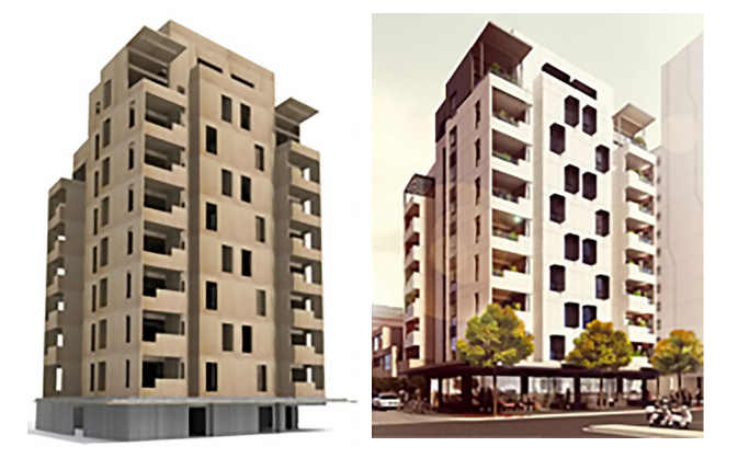
Figure 6. Forte Development, Melbourne, Australia (KLH UK, 2012)

ments and four townhouses. The apartments are dualaspect to make the most of natural lighting and have also been designed with thermal efficiency in mind, requiring less energy to be heated (Design Build Network, 2019).