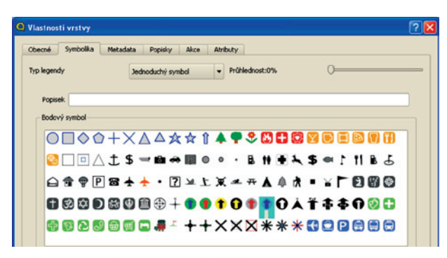
Fig. 1. The point symbol library in Quantum GIS

(weights or priorities), which are used to calculate a score for each alternative.