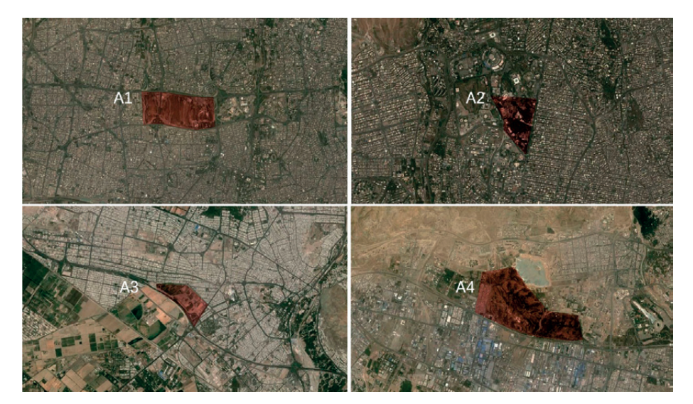
Fig. 3. The location of cases in urban space

Presenting a framework and evaluating the needs from several perspectives, the researcher proposed these six areas and fields in this research. Then the experts stated their opinions on identifying relative importance of each criterion to estimate the values of each criterion and finally, experts evaluated alternatives. The main point in this part is experts consider all of criteria qualitative. The model didn't consider cost of establishing the glasshouse because this project is national and selected places are in ownership of Tehran municipality. In addition, quality is more important against cost issue. An issue should be considered that there isn't an ideal alternative (place) and alternatives didn't comparison to ideal alternative. Relative advantages of each alternative are considerable. The concentrate of experts is on strategic perspective. This research is just concentrate on strategic perspective on glasshouse locating and management. To put it