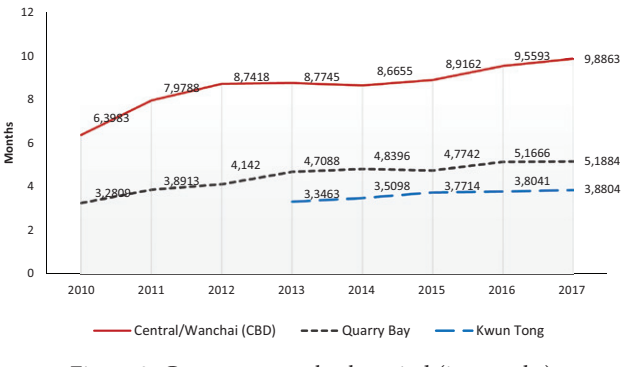
Figure 2. Green costs payback period (in months)

Note: * high-rise office, prestige quality; QB = Quarry bay; KT = Kowloon Tong.