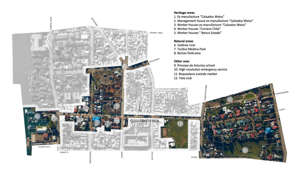
Figure 2. Guillermo Frick Street environment. Urban sector examined