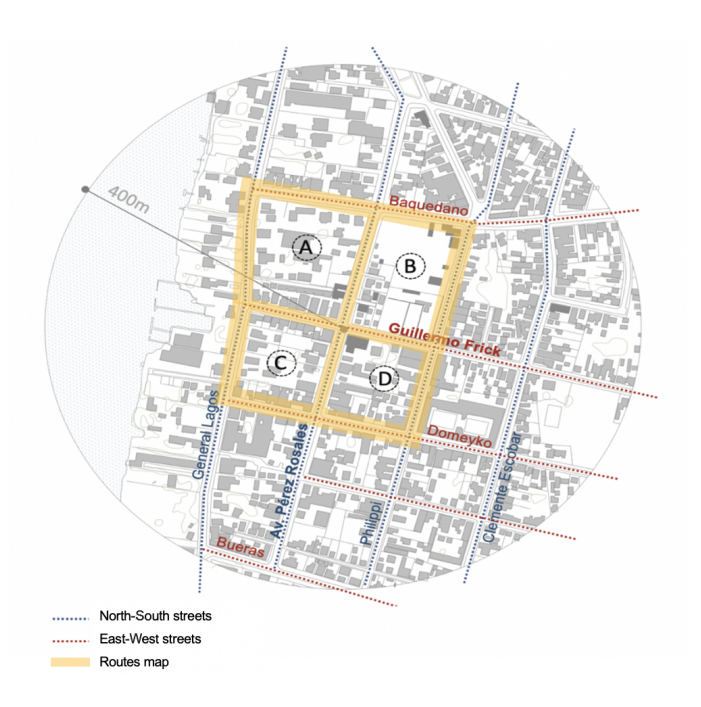
Figure 4. Morphological street analysis around Prince of Asturias school

The urban blocks were measured to assess pedestrianization levels. The four blocks studied (A, B, C, D) show that the East-West streets are shorter and more regular, while the North-South blocks tend to be longer and irregular (Table 3). Block B is where the ruin of the former Weiss footwear factory is located. This is the one with the largest dimensions, so its morphology is not the most appropriate to encourage pedestrianization. However, towards Frick Street, the length of the block is 120 m, which allows greater pedestrianization. In this sense, the pedestrianization process of a particular sector of a city can be defined as removing or even restricting number of vehicles from a specific area and devoting it to pedestrian use only. The medium-size cities of southern Chile, such as Valdivia, should begin to devote great attention to the