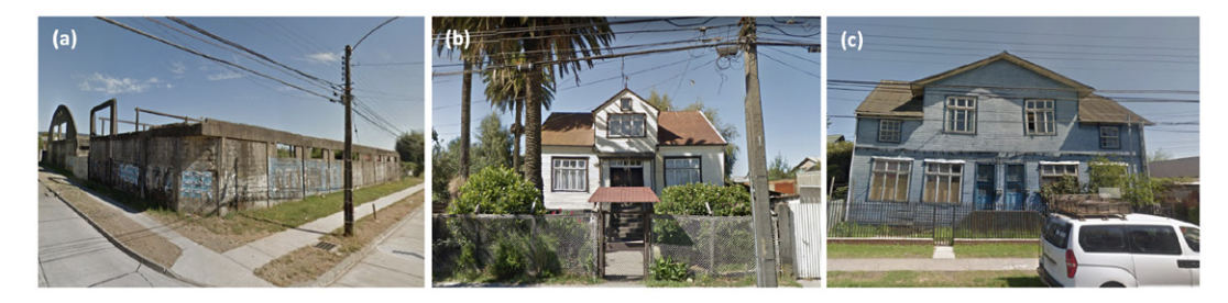
Figure 7. Pictures of the three case studies under analysis: a - Weiss shoe store; b - Heller house; c - Gómez brothers' house

This construction collapsed with the earthquake of 1960 and therefore is today in a state of ruin. There are only solid elements resistant to the passage of time, mainly of