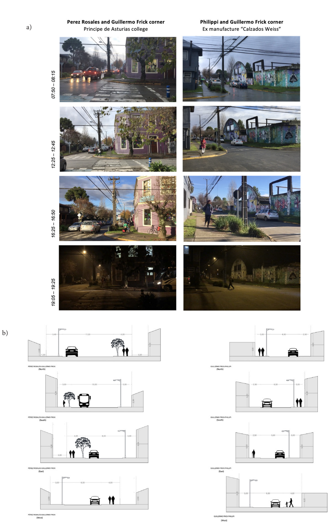
Figure 5. Analysis outcome summary of static captures in Barrios Bajos: a – images of the urban sector under analysis during the four moments considered; b – street profiles of analized corners of Guillermo Frick with Perez Rosales and Philippi streets