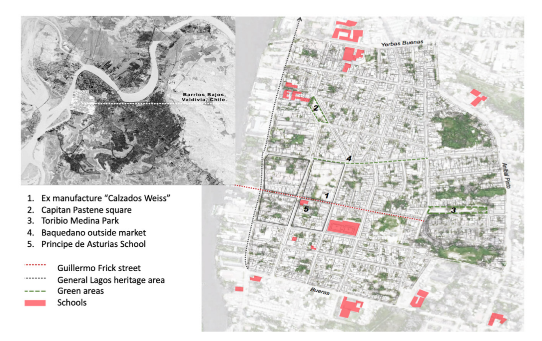
Figure 1. Location of Barrios Bajos sector within the city of Valdivia (left). Location of the case studies in the urban area under study (right)

of pedestrian mobility to the neighbourhood (Figure 2). The section chosen for analysis corresponds to a node of concentration of activities and vitality in the axis due to the presence of the Prince of Asturias school. This urban intensity coexists with heritage elements identified in the axis. The study proposes to analyse this relationship between heritage and new uses in order to understand how they coexist and how this is manifested in the urban space they share. Figure 2 shows the visual connection from the river edge (ID6 and ID12) to the upper plane of the city (ID7 and ID8) (Figure 2). From ID1 to ID5 and ID9 are the elements chosen for the pedestrian accessibility and vitality analysis. ID1, ID2 and ID3 are the properties chosen from the functional service life examination (Figure 2).