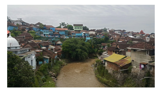
Figure 2. The Malang Kotalama settlement