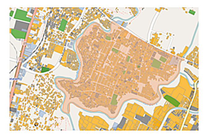
Figure 1. The area of Malang Kotalama settlement

The community's interaction with the built environment in the cultural context can be viewed from a traditional perspective which includes kinship patterns and the traditional use of cultural space which are all based around traditional activities and the formality or informality of social activities (Jenkins, 1997). In reviewing the literature, kinship, religion, and the language used to communicate with the community in daily life, become the identity markers of the community and culture of the Madurese (Wiyata, 2013). This was also found to be the case at the Kotalama settlement. Furthermore, although surrounded by the majority of the population who speak Javanese, the