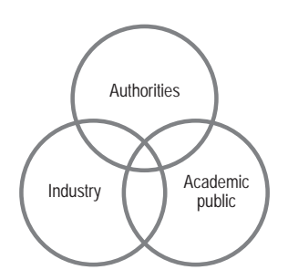
Fig. 3. The 'triple helix' model of overlapping elements

The application of different configurations of the 'triple helix' model depends not only on determined goals in science and area of research and development, but also on political and socio-economic situation in the country. The first model, in which one sphere dominates the others, is suitable for the countries with strong influence of authorities, where the government sets the priorities in industry development and provides financial tools for it. The tendency is observed in the countries with close type of economy, with strong ideological dominance in socio-economy or during the economic transition from one form to another. In Lithuania this model was in use during being part of Soviet Union and economic transition period in the 90s until in 2001 Lithuania's White Book on Science and Technology was accepted.