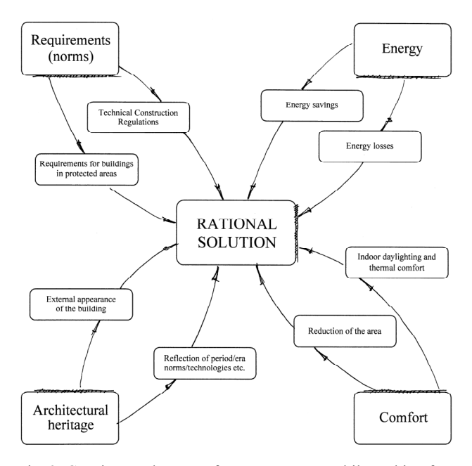
Fig. 2. Consistency between four components while seeking for sustainable development of old vernacular architecture

Four components, such as architectural heritage, requirements (norms), energy and comfort are proposed for searching rational solutions for old vernacular architecture. Each component can be described by various criteria. According to Figure 2 the criteria system have been formulated for the case study.