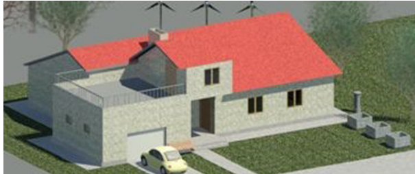
Fig. 6. Garage partially integrated into the house space

In the case of Scheme 4, the garage is partly integrated into a housing space (Fig. 6) as „stuffed” in the corner of the house.