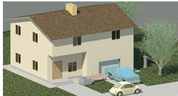
Fig. 5. Garage integrated into the house space

In the case of Scheme 3, the garage is integrated into the house space (Fig. 5).