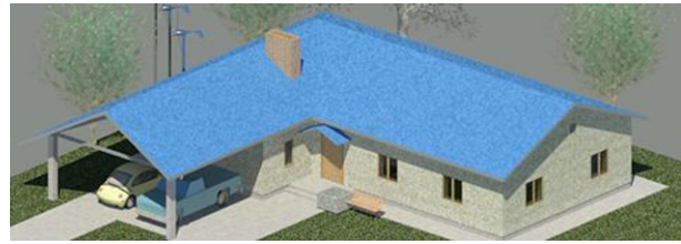
Fig. 4. Open shelter near the main facade side of the house

The volume of land works is the smallest because the foundation for the garage must be detached installed beneath two columns, then the foundation price will be