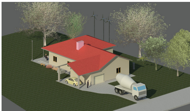
Fig. 7. The garage is divided into two spaces: closed and open

In the case of Scheme 5, the garage is divided into two spaces: closed and open (Fig. 5).