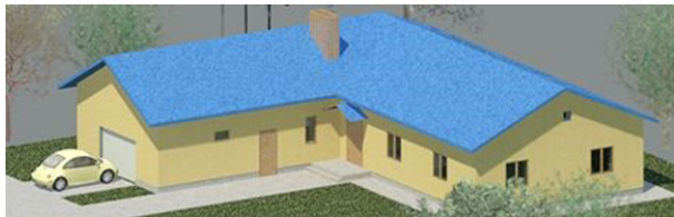
Fig. 3. Garage near the main facade side of the house

According to Scheme 1, the garage is designed near the main facade wall of the house (Fig. 3).