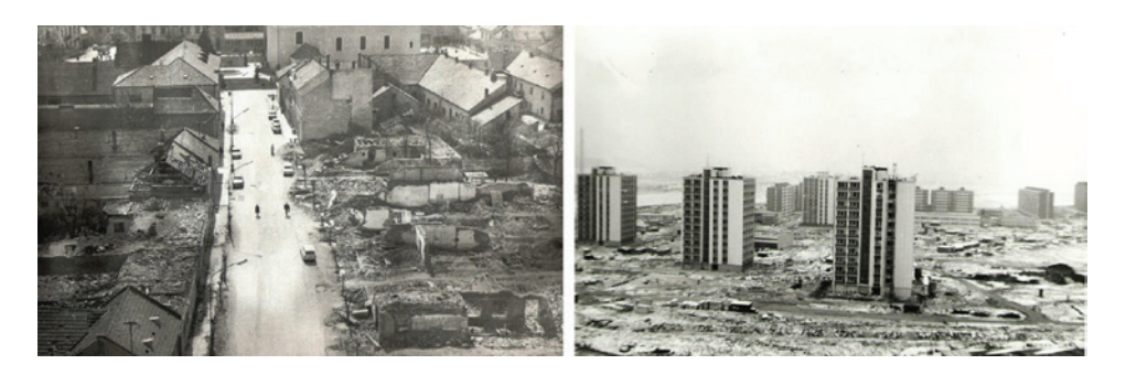
Figure 1. Destruction of historic urban structure in Bánovce nad Bebravou. and view of the construction of the Dubnička panel housing.

to modern urban design, which ignored the traditional forms of public spaces. We also seek future possibilities of new urban development to revitalize the towns structure and make it more compact.