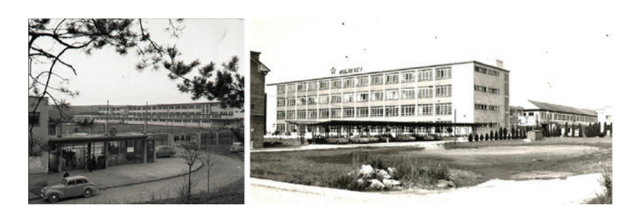
Figure. 3. View of the Tatra factory (1958). View of Zornica factory.