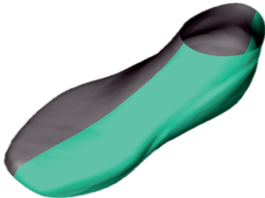
Fig. 1. View of divided shoetree

In total 20 fragments were flattened by ABF++, LSCM and ARAP algorithms. An error of each fragment was calculated by 2C/(A+B) , where A is area of original mould, B is area of flattened half-shoetree, C is the maximum area which can be obtained by intersection of original mould and flattened half-shoetree. A , B and C values were calculated by counting colored pixels of intersection of molds (Table 1–3). We've measured also differences between corner points, called margins (see Fig. 2). The dotted line corresponds to original mould, the solid line corresponds to boundary edges of flattened surface of shoetree. The values in Margins column in Table 1–3 coincides to difference in millimeters between corner points, numbered from 1 to 3 in Fig. 2.