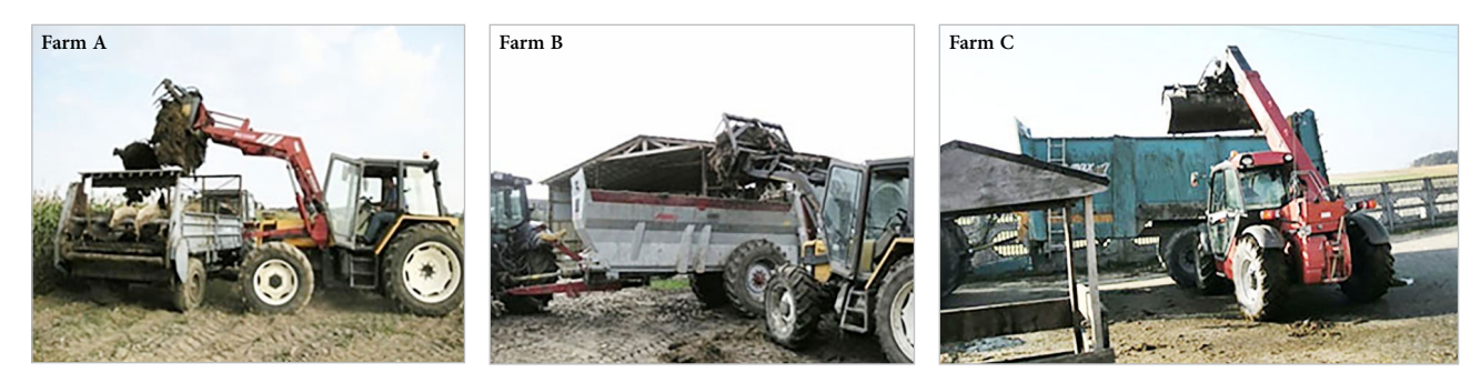
Figure 1. Fertilizing aggregates applied in farms A, B and C

class of a tractor was selected. The tractor class approximately corresponds to the drawbar pull down achieved in certain field conditions. The selection of the tractor was made in reference to a catalogue of agricultural machinery, as well as the Polish Standards (PN-82/R-36107:1982; PN-82/R-36108:1982) for tractor hitching and three-point suspension systems.