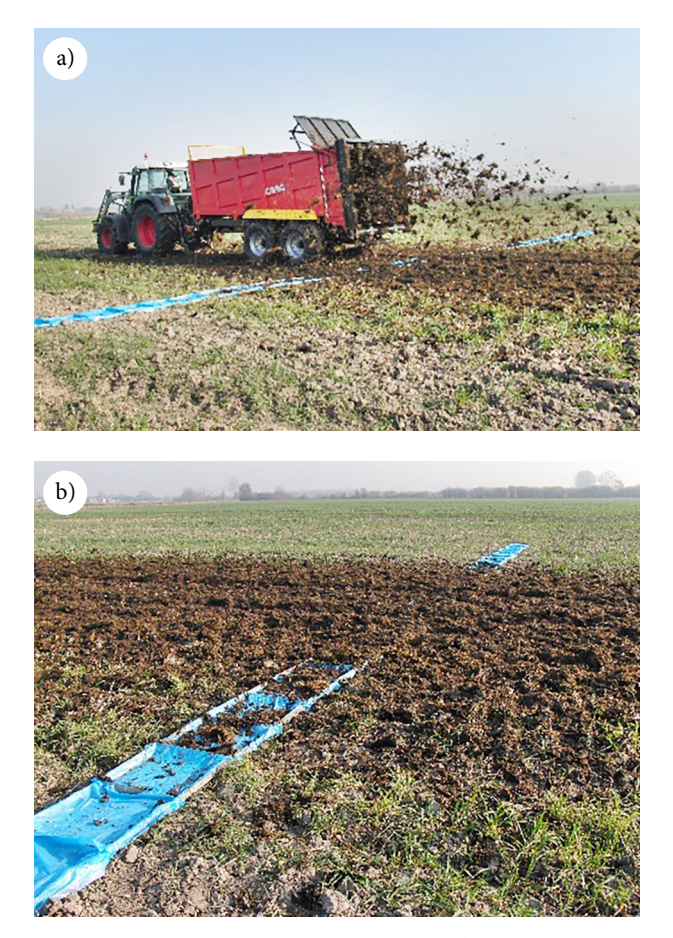
Figure 2. Manure spreader made by the Wielton company with 2 vertical drum spreading adapter when testing the transversal unevenness of manure spreading: a – movement of machinery over the laterally situated boxes for manure; b – distribution of manure in the boxes and on the field

The tests of a manure spreader with two-drum adapter used for the application of fermented manure of weight volume 960 and 600 kg/m<sup>3</sup> have shown that for the transversal unevenness of the spreading below 30% its working width amounts to 8 m.