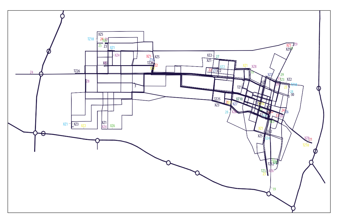
Fig. 2. The urban transit network in one of the cities